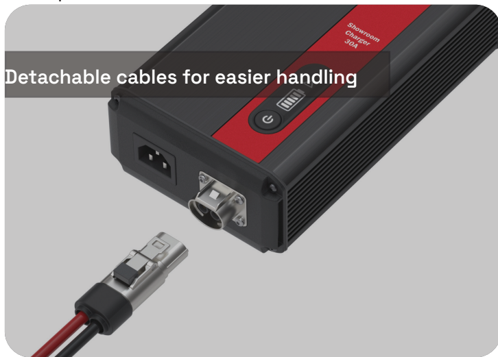
Detachable cables for easier handling

Keep your vehicles fully functional, ready for demonstration in a clean looking showroom. The ShowroomCharger 30-32A is our most compact charger, designed using modern switch-mode technology with 7 steps charging curve that optimizes battery performance and longevity. It can be used on all AGM, GEL, EFB and Lead Acids batteries. The charger can be easily placed under the car or the hood, out of view for your customers thanks to its compact size and detachable cables. Rubber feet and corners are available for further protection. You can upgrade the software at any time via the separate USB port.